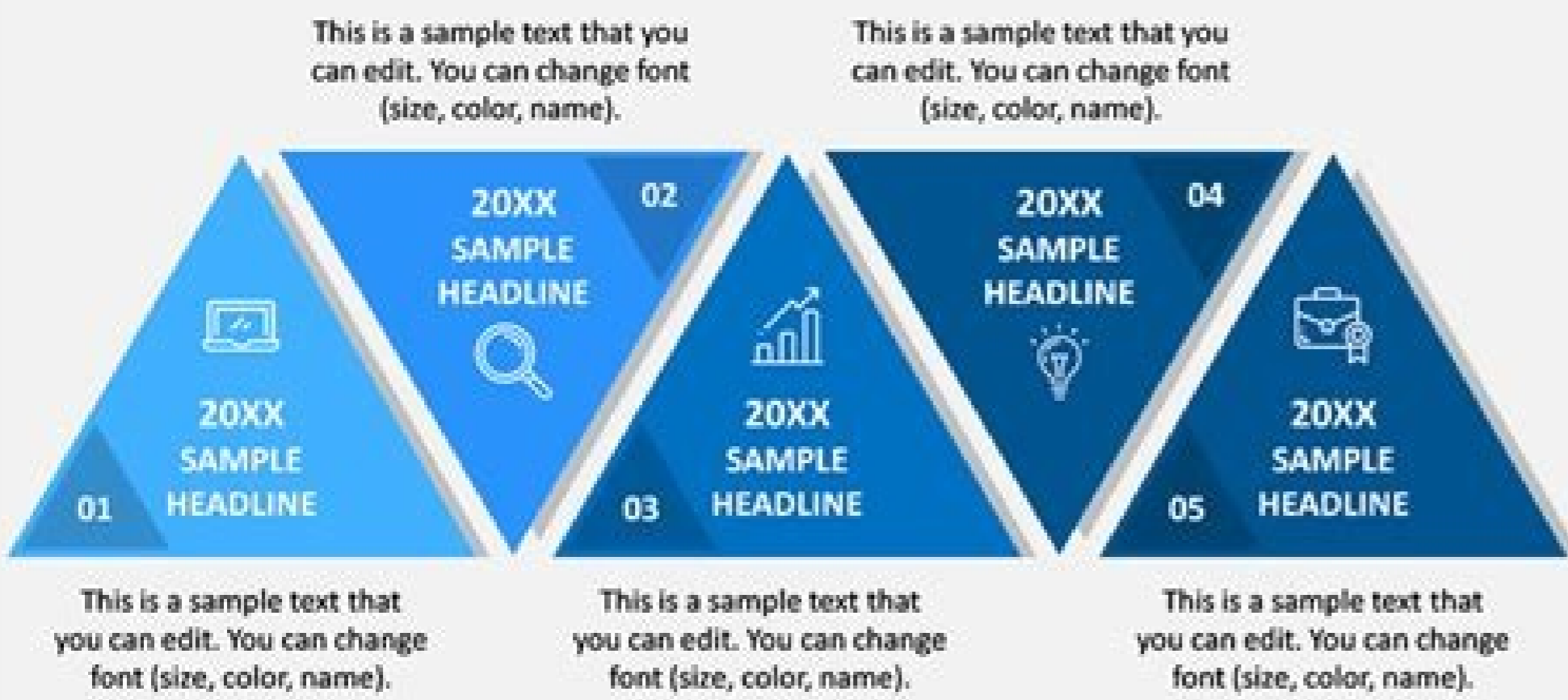
Professional leadership development plan example. Best professional development plan template. Personal and professional development plan example. How to write a personal professional development plan. Examples of professional development plans.